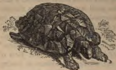
Fig. 4. TORTOISE.

to the serpent, lizard, or crocodile extremely unapparent. But who has comparative anatomy say respecting the building of the chelonian house? Look at the roof formed by the greatly expanded ribs and solid spinous processes. Look at its sides formed by the cartilages or ends of the ribs; and its floor formed by certain skin-bones comparable roughly in their nature to the large scales of the crocodile's under surface, and in any case presenting us with no structures unusual or foreign to the reptilian class. The boxlike body of the animal is, in short, formed by so many of its skeleton, and so many of its scales, altered and modified to suit the animal's way of life; and presents us thus with no new thing in the way of structure, but with an elaboration of the common elements of the reptile body.